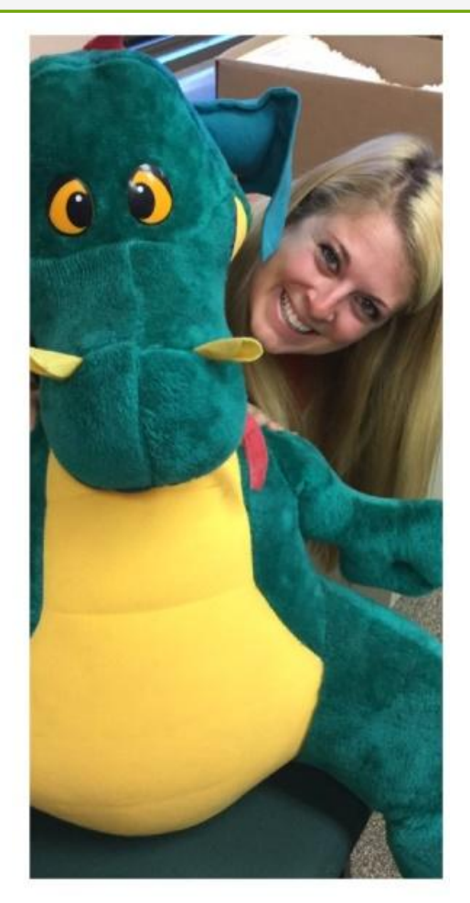
Breakfast -7:40-8:10 All Clear Bell and

Attendance/Announcements-8:17 Late Bell-8:20